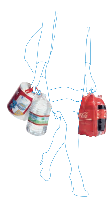
C Tape Carry Handle Solution by Alimac